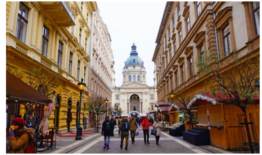
Street scene looking towards St. Stephen's

I count it a privilege to have spent my Christmas holidays in its capital city. While en route to Budapest, my seat mate (a Swiss guy) and I began conversing, comparing passport stamps and sharing our travel itineraries, when he nonchalantly remarked, "You know, a traveller is someone who is at home everywhere", which turned out to be sage advice for someone who is in a perpetual state of wanderlust. His words lingered on a week later as I watched the captivating city gently disappear into the clouds after take-off and realised while on my winter sojourn, my heart has found a home in Budapest, one to which I plan on returning very soon.