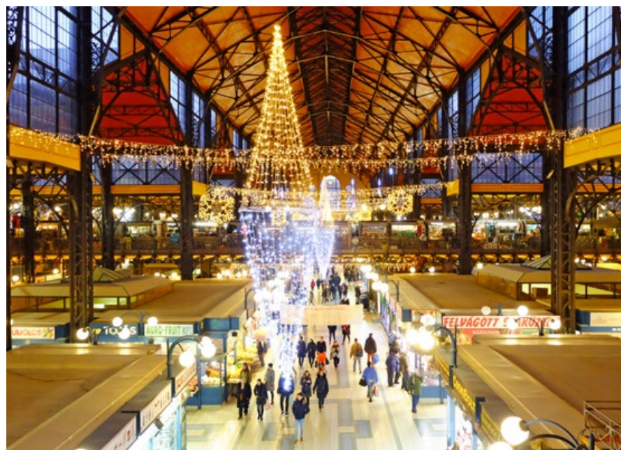
Central Market, Grand Hall