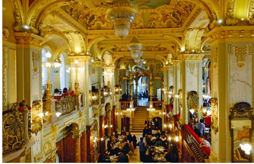
New York Café

In the 15th century, invading Ottoman Turks introduced a new spice to the country – paprika. While the rest of Europe remained lukewarm towards this flavourful red chilli pepper