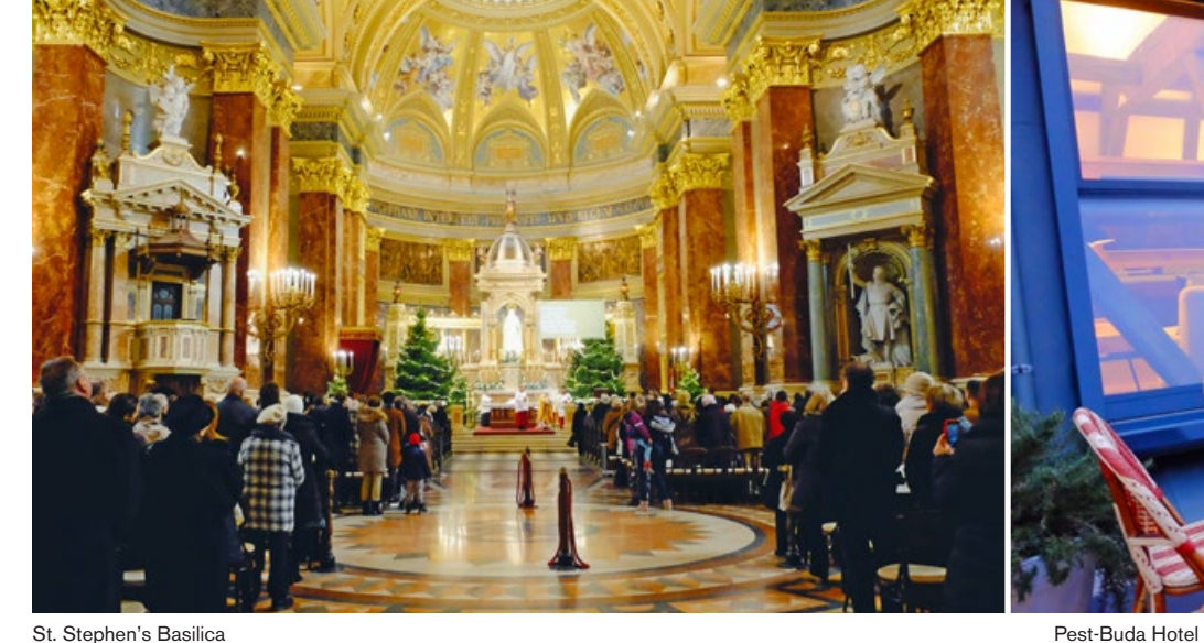
St. Stephen's Basilica

Shoppers can also check out the Great Hall at Central Market, an ideal place to find an array of goods. Built in the 19th century, this three-floor covered market has shops upon shops selling everything from grocery produce on the ground floor and souvenirs such as fridge magnets, to paprika, Zsolnay porcelain, Palinka (a potent, locally-produced fruit spirit with a minimum of 50% ABV), and even